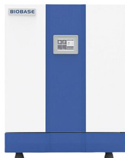
Double-layer Door (D type)